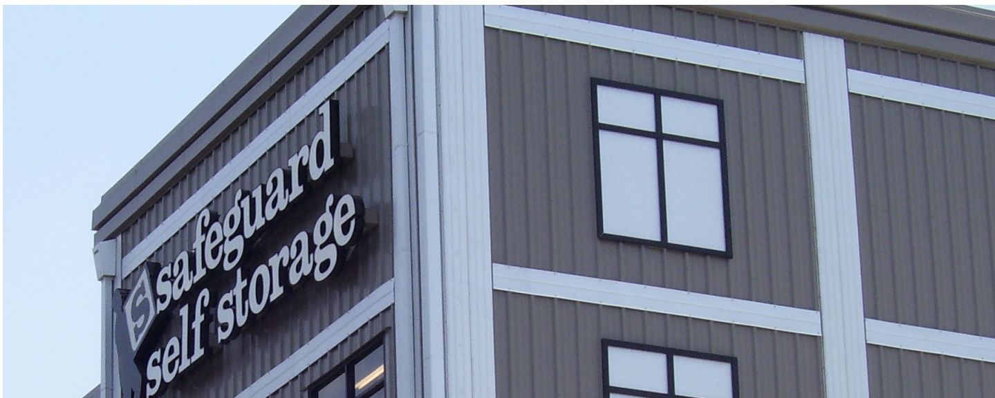
Safeguard Self Storage, New Orleans, LA, USA

Fabral®'s Mighti-Rib® panel is perfect for use in Self Storage buildings as well as other industrial and government design projects. 280 squares of Mighti-Rib® in Slate Gray were used to complete this large project. Mighti-Rib®'s versatility makes it easy to specify and easy to install.