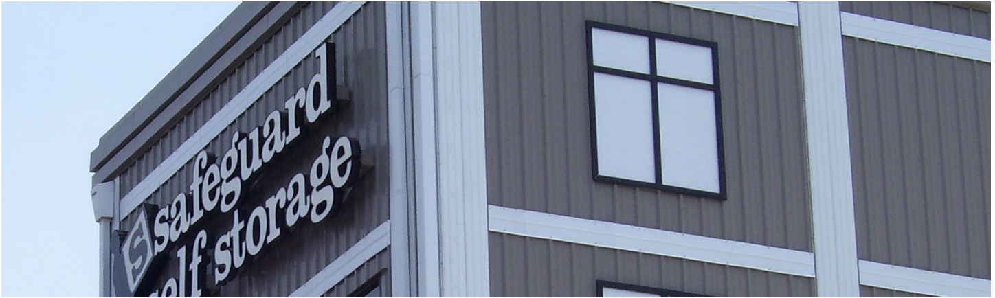
Safeguard Self Storage, New Orleans, LA, USA

Fabral's exposed fastener panel product offering is perfect for use in Self Storage buildings as well as other industrial and government design projects.