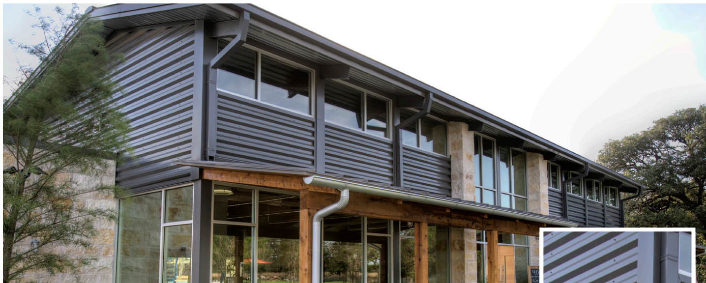
4.0 Wine Cellar, Fredericksburg, TX, USA

"For this winery concept, we selected the Hefti-Rib panel. It created bold shadows, installed quickly and was easy to acquire. We were so pleased with it that we used surplus material to build and skin an adjacent well house."